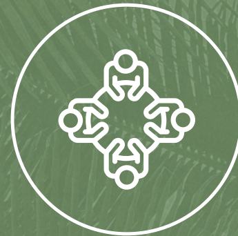
The community members engaged in project work

This model has enabled us to self-fund significant engagement and investment in communities most in need. Our financial freedom allows us to combine activities that might not align with traditional funding guidelines and to design tailored program experiences for diverse participant groups.